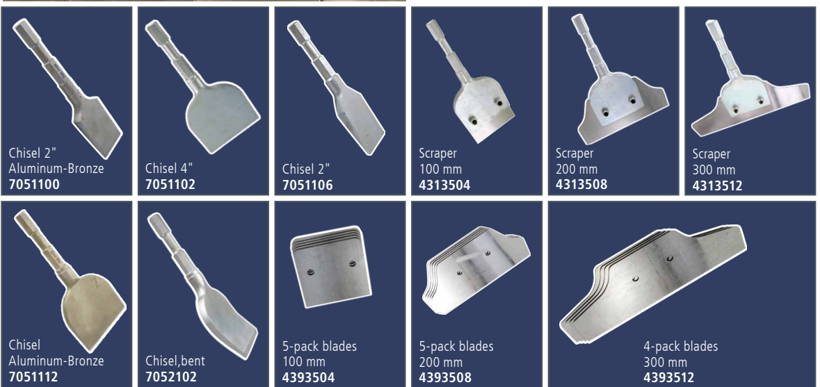
Chisel 2" Aluminum-Bronze 7051100