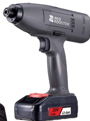
RRI-BS SERIES Torque: 0,8 - 12 Nm