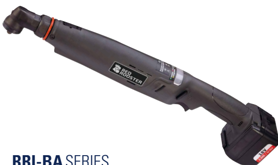
RRI-BA SERIES Torque: 3 - 70 Nm